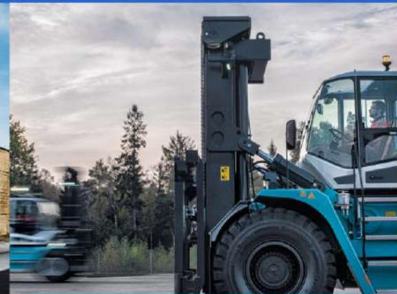
ELECTRIC FORKLIFTS, 10-18 TONS