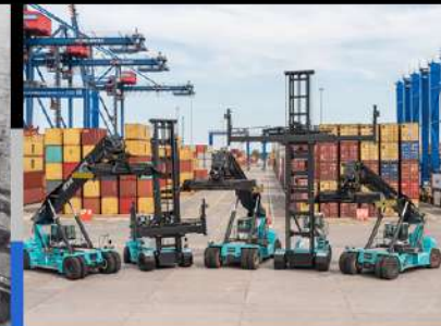
EMPTY CONTAINER HANDLERS, 8 - 11 TONS