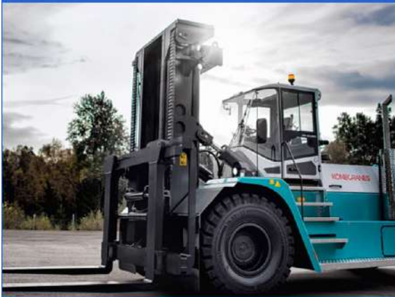
10 - 18 TONS FORKLIFT