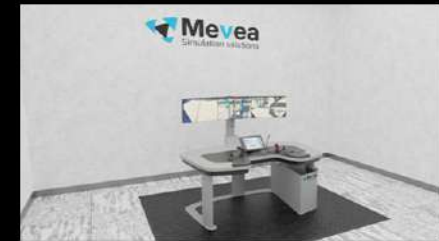
MEVEA REMOTE OPERATION STATION