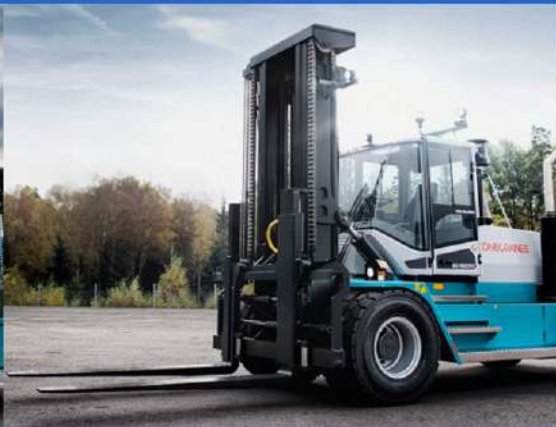
18 - 33 TONS FORKLIFT