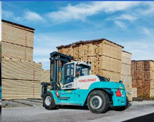
37 - 65 TONS FORKLIFT