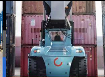
REACH STACKERS, 10-46 TONS