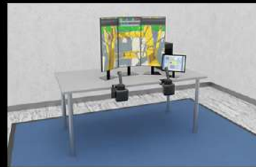
MEVEA MASTER KING