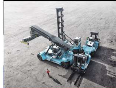
LADEN CONTAINER HANDLERS, 26 - 52 TONS